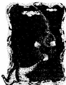
Paul Kendrick, Vice Commodore

It is unlawful for any person operating a vessel involved in a boating accident to leave the scene without giving all possible aid to the involved persons and without reporting the accident to the proper authorities.